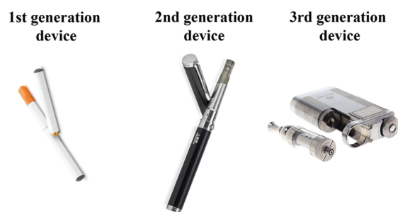
Figure 1. Examples of electronic cigarette devices currently available on the market.

consisting of very large-capacity lithium batteries with integrated circuits that allow vapors to change the voltage or power (wattage) delivered to the atomizer. These devices can be combined with either second-generation atomizers or with rebuildable atomizers, where the consumers have the ability to prepare their own setup of resistance and wick.